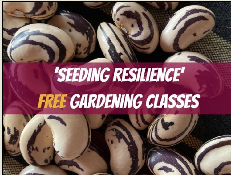
Too beautiful to eat: Sondrio Select Italian dry pole beans