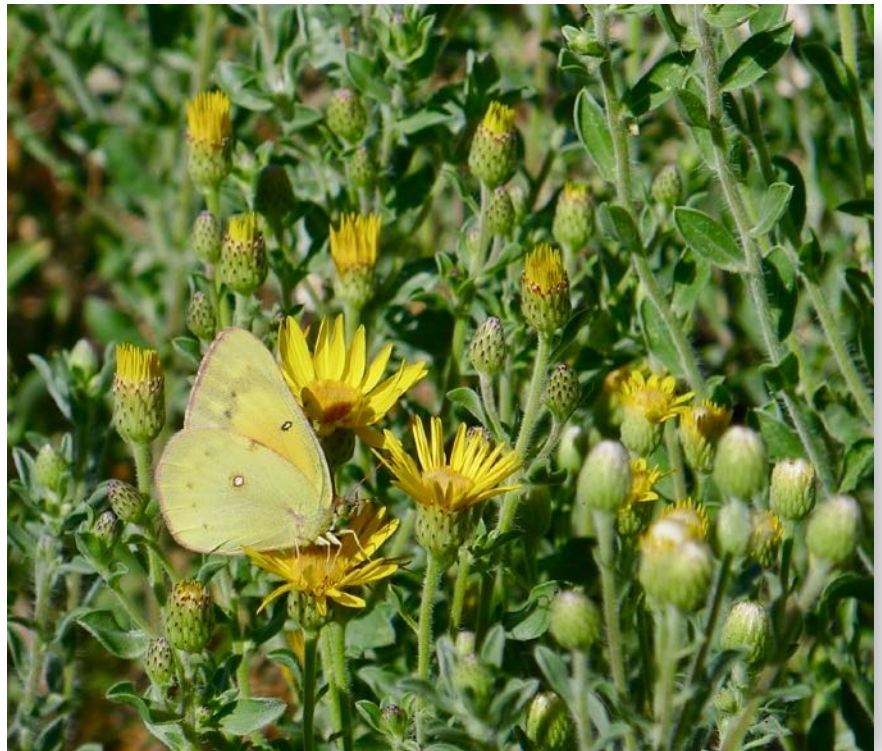
Southern Dogface ( Zerene cesonia) nectaring in hairy goldenaster

The native distribution of hairy goldenaster, a member of the largest family of dicots, Asteraceae, extends across the central and western part of North America, from coastal British Columbia to Baja California; east to Texas, Nebraska, Wisconsin and Ontario; and south into northeastern Mexico. It is widespread throughout New Mexico, notably in northern New Mexico and Santa Fe County.